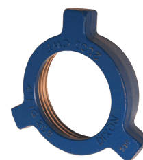
3" and 4"