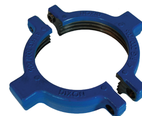
figure 200 / 206