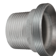
6" and 8"