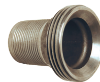
3" and 4"