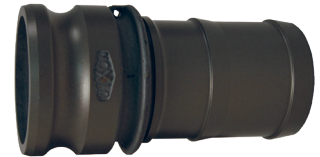
aluminum hard coat