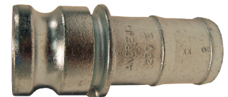
plated malleable iron