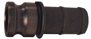
unplated malleable iron